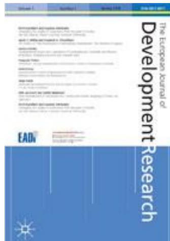
Volume 30, Issue 1, 2018

Web page: http://www.palgrave-journals.com/ejdr/index.html