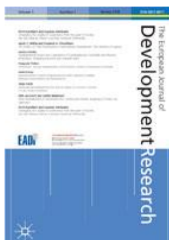
Volume 29, Issue 5, 2017

Web page: http://www.palgrave-journals.com/ejdr/index.html